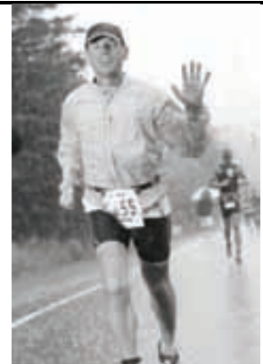
The Iron Friar